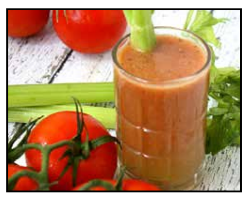
Haworth Wholefoods and Worth Valley Mag bring you fresh juice recipes to celebrate the launch of Haworth Wholefoods fruit & veggie boxes.

vodka (optional) small inner celery ribs with tops